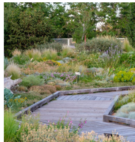
Mordecai Children's Garden green roof.

For many building owners and developers, the common private benefits may not be perceived as sufficiently quantified or immediate enough to justify the additional upfront capital investment. This is where financial and regulatory incentives become important. Examples include the City of Toronto's Eco-Roof Incentive Program which offers CDN$100 per square meter of green roof and Washington DC's US$15 per square foot incentive in targeted watersheds where combined sewer overflows are frequent.