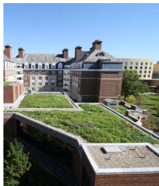
LAPT Silver: Harvard Business School's McArthur McCollum Building.

Municipalities do not need to invent such a framework (unless they really want to): The Living Architecture Performance Tool is available to calibrate the performance of green roofs and walls. It provides a scientifically based framework of performance measures and minimum prerequisites for the design, installation, and maintenance of these technologies.