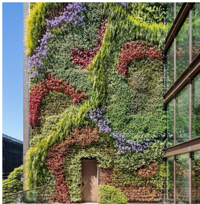
Photo: Habitat Horticulture Exterior Living Wall at 2177 3rd St. in San Francisco, CA.