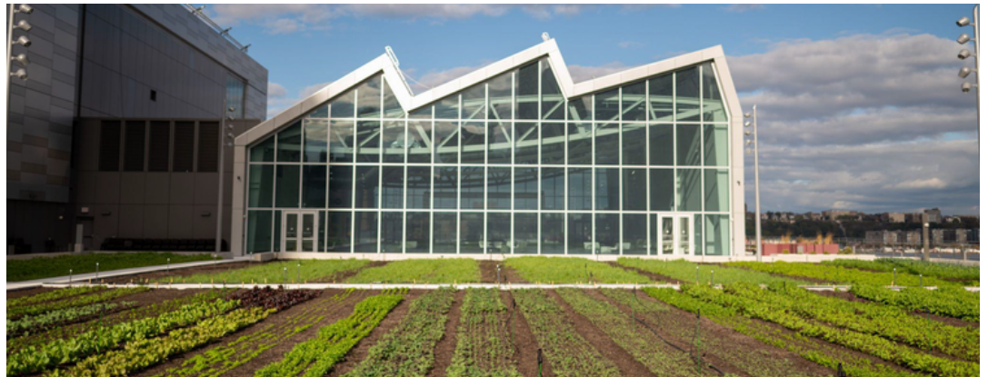
The Javits Center, New York City. The waterproofing is done by American Hydrotech, and the urban agriculture assembly is managed by Brooklyn Grange.

Growing food on rooftops is an increasingly widespread application where urban farmers grow food crops on specially designed green roofs. A wide variety of crops, from vegetables to vineyards, can be cultivated on rooftops.