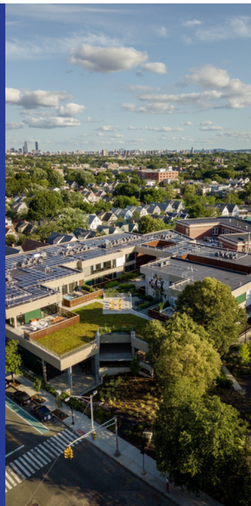
Powderhouse, Somerville, MA.