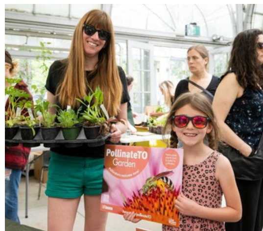
PollinateTO grant recipients, Toronto.

Incentives have played a big role over the last decade in many cities, particularly when the benefits of green roofs were unproven and/or unknown. Incentives make sense now, only if it is the only politically viable path.