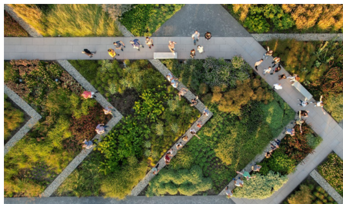
The Old Chicago Post Office in downtown Chicago

Green roofs are able to provide additional thermal insulation benefits for many roofs, thereby reducing energy consumption associated with space heating and cooling. Portland State University and Environment Canada established an Energy Calculator which provides base levels of energy savings in multiple climates across North America. Many of the energy savings benefits to buildings depend on their age, with older buildings often lacking sufficient insulation the benefits are greater.