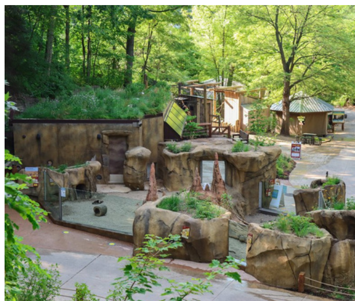
LAPT Platinum Certified green roof at the John Ball Zoo in Michigan

The likely arguments against green roofs are generally predictable and typically centered around cost and technical issues. Stakeholders should be identified at the beginning and early outreach should anticipate such concerns, and be prepared to address them as they arise, regardless of the form of public process.