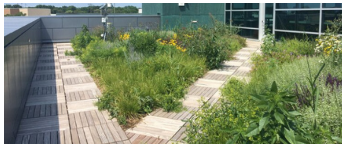
East Building Addition, Adlai E. Stevenson High School, Lincolnshire, IL.