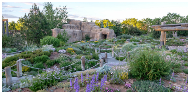
The mixed intensive-extensive green roof at Denver Botanic Gardens.

Increase in property values with a corresponding return in property taxes to the city