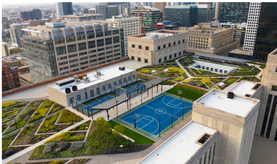
The Old Chicago Post Office in downtown Chicago