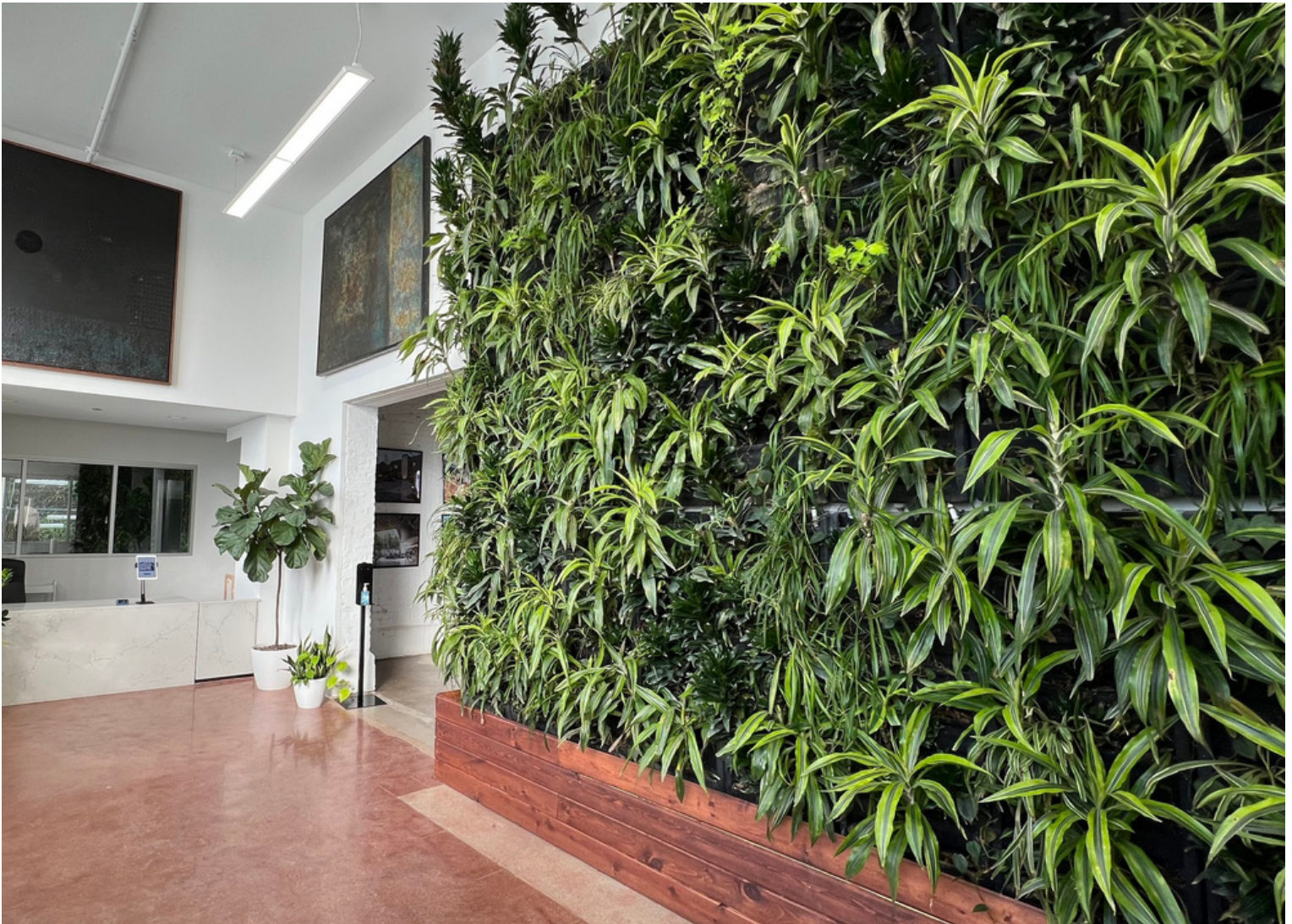
The lobby of Hatch 41, Chicago, IL.