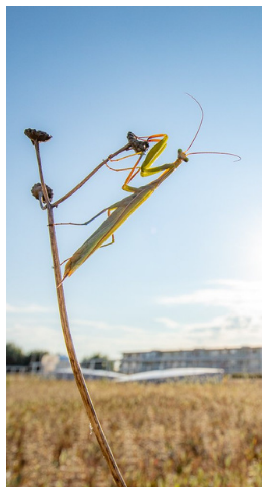
Praying Mantis on Basel's biggest green roof on Stückli Shopping mall.

Plants and soils/engineered growing media, sequester carbon and produce oxygen. Green roofs can play an outsized role in a communities' climate action, mitigation and adaptation plans when deployed in the aggregate. Green roof mandates begin to address the need to achieve wholesale deployment of this important tool. The more types of vegetation and deeper growing media deployed, the greater the carbon sequestration impact.