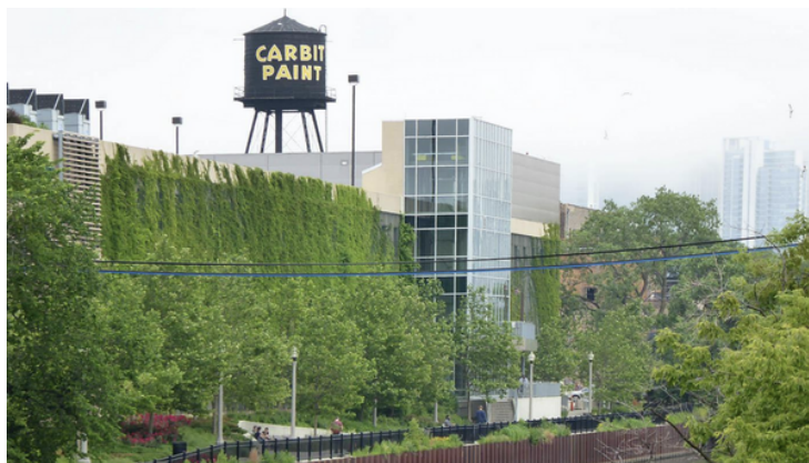
The Shoppes at Kingsbury Square, 2014

Facades are a structured system of stainless steel cables or grids that support climbing plants growing in planters from a planter bed, supported by a wall or other structure element or directly in the ground.