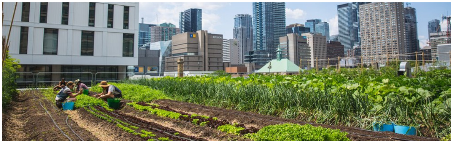
The Urban Rooftop Farm on the Toronto Metropolitan University (TMU).

Given the variety of buildings, both new and old, that exist, it is important to recognize that policy may need to be fine tuned to meet the specific needs of different market segments. Financial analysis of the costs and benefits of different policies for new and existing buildings, will help policy makers avoid potential conflict with building owners. Existing buildings are rarely 'required' to install a green roof or wall after the fact, but rather, are provided with incentives to do so.