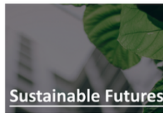
Summer 2023, Podcast