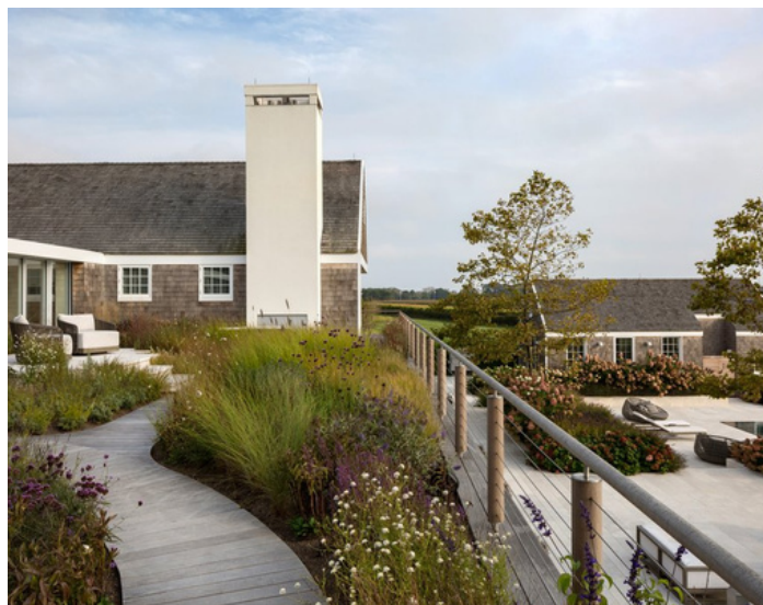
Award of Excellence winning Coastal Cottage, South Shore, Eastern Long Island.

Clearly defined requirements are readily achievable and can spur and expand the development of higher quality green roofs and lower costs as markets mature. This is especially true in stormwater management permitting where high-performance green roof systems can outshine lower performance green roof systems. This may require the testing of various systems and components, to ensure their performance meets code requirements. There are several ASTM testing protocols specific to green roof components that provide consistent, across-the-board results. See appendix A for all green roof standards.