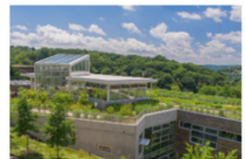
Summer 2023, Case Study, Phipps Conservatory and Blaine Stand