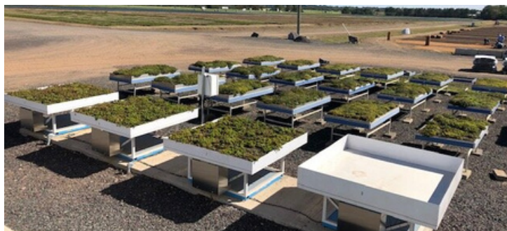
Stormwater retention testing.