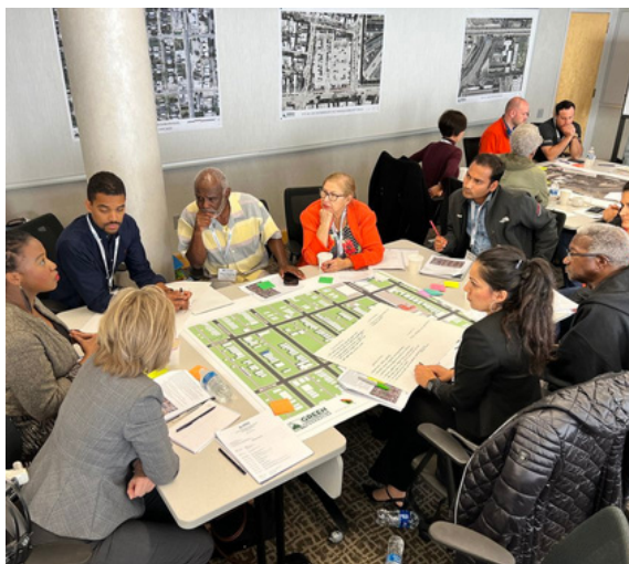
A Charrette program.

The Green Infrastructure Foundation (GIF) is the charitable arm of Green Roofs for Healthy Cities. It has an independent board of directors. It supports policy development through community engagement, training and research.