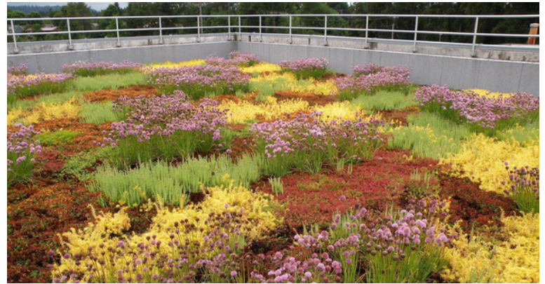
The extensive green roof at the Tri-City Water Resources Recovery Facility - Oregon.

Typically the thinnest assembly (2 - 6 inches of growing medium), these green roofs are some of the most common green roofs constructed today. In certain areas of the USA, these extensive green roof systems are used for significant stormwater Best Management Practices (BMP) facilities. Variants in components can greatly increase the water holding capacities of these extensive assemblies.