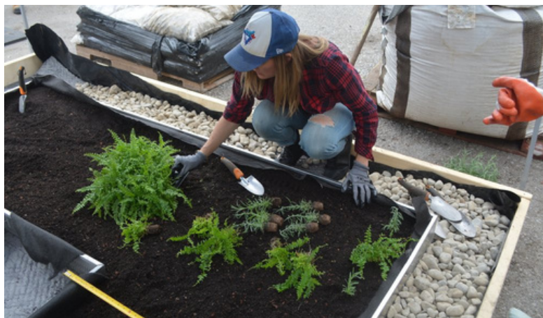
Green Roof Installation and Maintenance Professional (GRIMP) training in progress.

The following document summarizes green roofs and wall policies across Canada and the United States that encourage widespread adoption. The policies are separated into two categories - mandatory requirements and incentive programs. There is also a section that lists other policies that promote green infrastructure for stormwater management. These case studies can be used in conjunction with Green Roofs for Healthy Cities' other resources to create well-developed and effective policy.