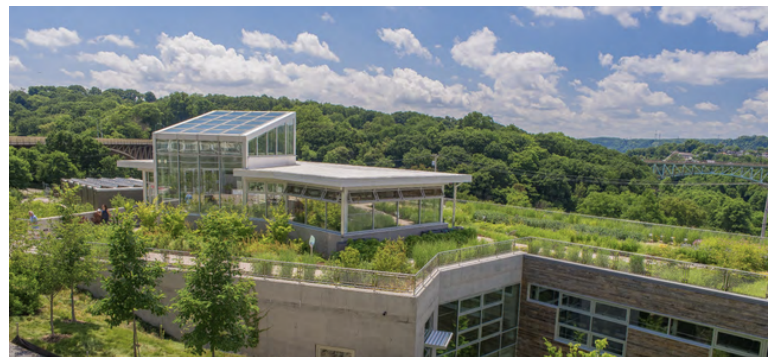
An intensive green roof at the Phipps Center for Sustainable Landscapes 2020.

As the growing media thickness gets deeper (8 - 48 inches), intensive green roofs successfully support a very wide array of plant species and sizes including full size trees. Very often intensive green roofs are combined with other features such as pedestrian and amenity features to increase the usability of these rooftop environments.