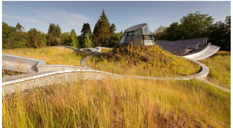
Van Dusen Botanical Garden Visitor Centre 2017 by Connect Landscape Architecture Inc. with Architek.

These green roof types retain and detain stormwater within an enhanced green roof section by augmenting the growing media with synthetic materials that act like sponges in the green roof. Unlike Blue Roofs, stormwater in a Blue/Green Roof is held in the pore spaces in the growing media and synthetic elements and released via transpiration and evaporation from the plants within the Blue/Green green roof assembly.