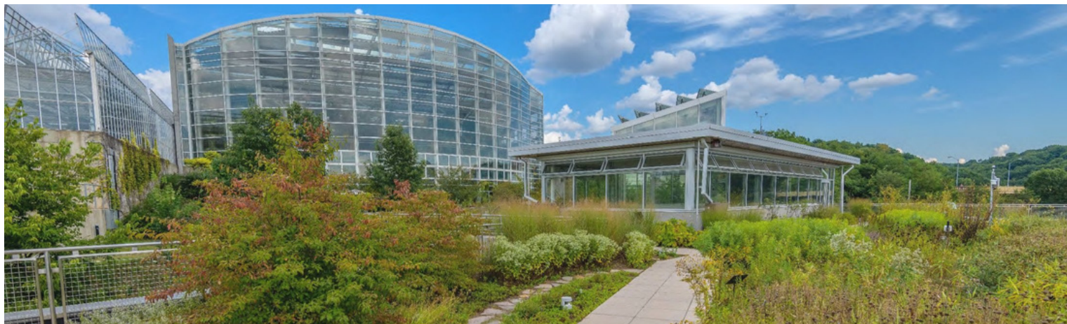
Plants growing naturally along the sidewalk, some leaning in.

In some jurisdictions, where such policies and regulations have been considered, initial costs for a green roof have – unsurprisingly – proven to be a political challenge as development constituencies have reacted to first costs rather than considering life cycle costs. However, in a variety of markets, geographies, and bioclimates, the life cycle value and financial return of green roofs has been demonstrated to be consistently robust, resulting directly in the increasing number of cities establishing mandatory requirements typically focused on new buildings.