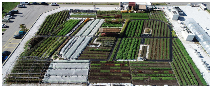
IGA rooftop farm, Quebec, Canada.