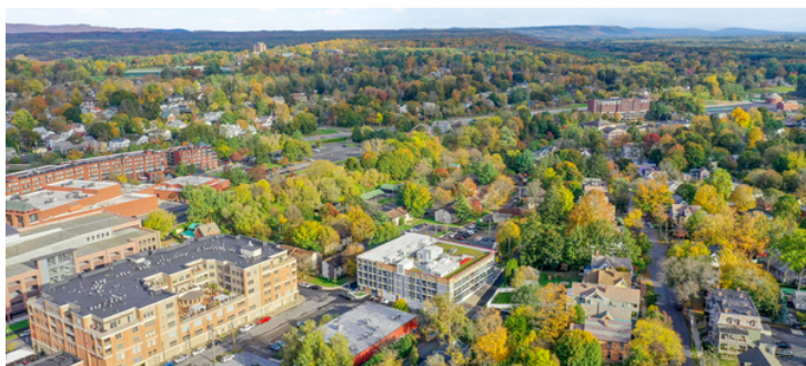
Moderne, Saratoga Springs, NY.

Green roofs have the ability to retain stormwater through the plants, growing medium and additional layers that capture and hold, or slow the progress of water off a roof. Many jurisdictions recognize green roof assemblies for their stormwater retention benefits through stormwater regulations. In recent years, manufacturers have begun introducing green roof systems that enhance the stormwater retention capacity of green roofs, often through the use of cups in the drainage layer, fabrics or fleeces that expand to hold more water. They are also incorporating systems that allow for the detention of stormwater (typically up to 6 inches in depth) for a period of time, often two to three days, before controlled release. The detention capacity gives civil engineers a greater degree of certainty over stormwater management than retention alone. Managing stormwater on roofs, can save developers costs associated with below grade or under-building stormwater detention structures and the space and mechanisms they require.