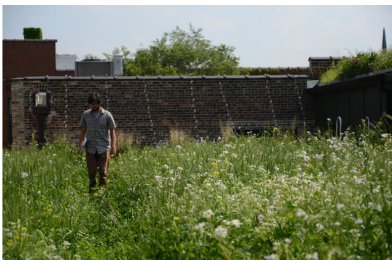
Carroll Rooftop Farm, Chicago, IL.

In this age of significant public resource constraints, and growing challenges, green roofs and walls provide proven approaches to meeting multiple policy objectives at minimal cost, and can contribute over time, to helping make our communities more resilient.